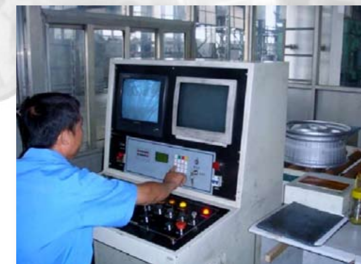
QC : X-Ray