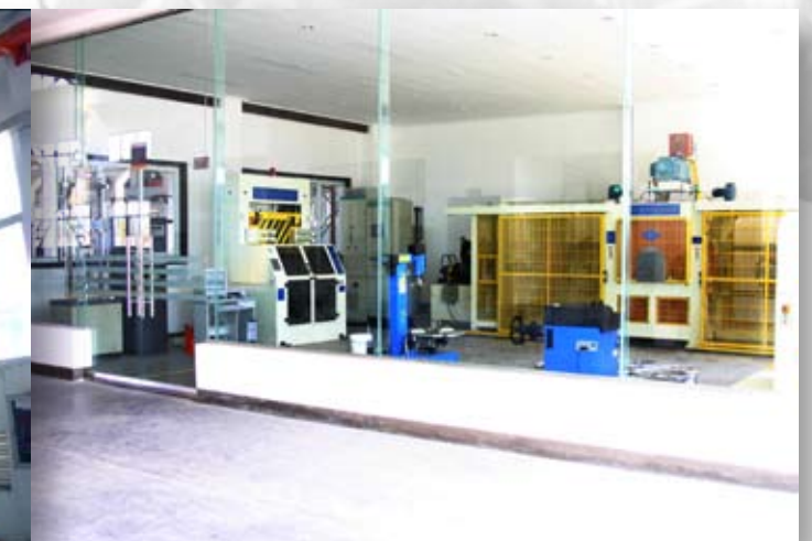
QC : JWV VIA Testing