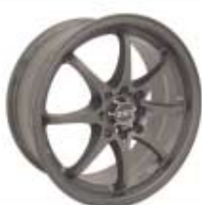
FI LIGHT 15x7

Limited Edition - Blackout Series * Wheels are available in other coatings.