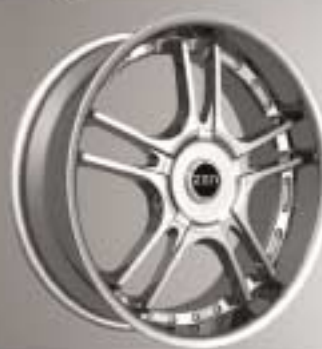
Type R 17/18"