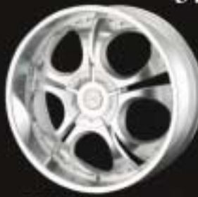
260 Silver 20/24"