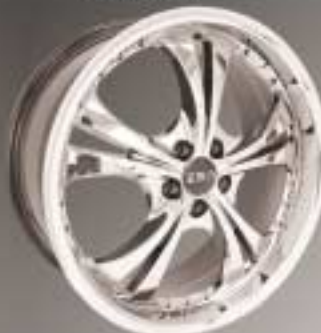
Spyder III 17/18"