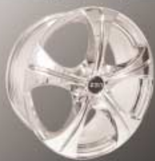
Spyder IV 17/18"