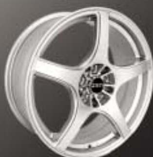
Z-5 Tuner 17"