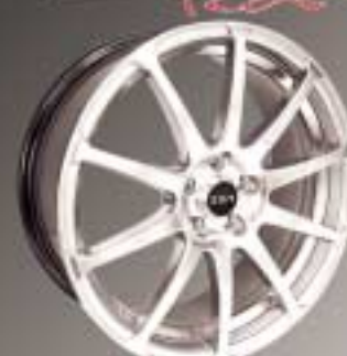
Type Z 15"/17"/18"