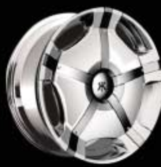
MB II Tone 18/20"