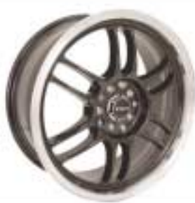
Z1 TUNER 17