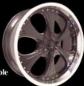
RC6 Black 20/22"