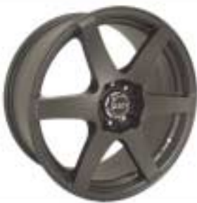
TYPE ZR 17