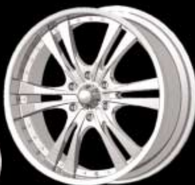
SPLIT SIXX 22"