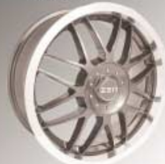
Vortex Evo 17/18"