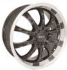
Z3 TUNER 18