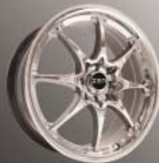
Z-2 Tuner 16/17"