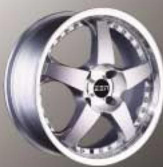
ZR Spec (Silver) 16/17/18"