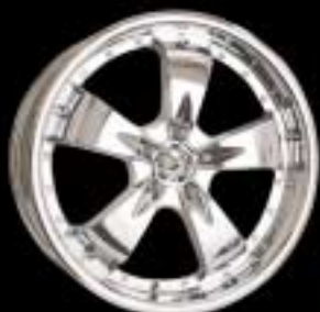
*ELEGANCE 17/18/20" * Staggered Fitments Available