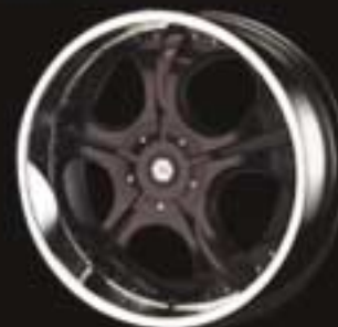
260 Black 20/24"